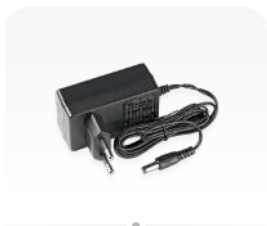
24 V 1.2 A power adapter