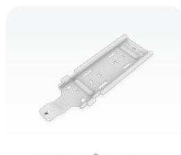
Outdoor case bracket