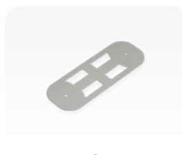
Ceiling mount base