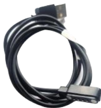
Magnetic charging wire(X1)