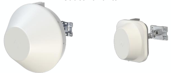
35cm size w/ 60GHz + 5GHz